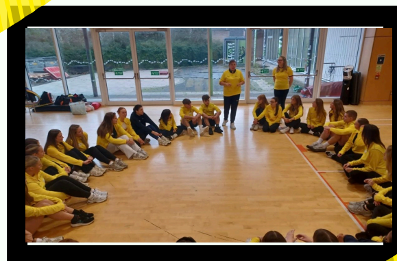
Irvine Pg 45