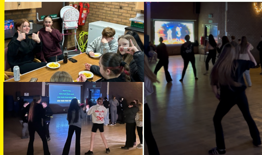
3TLP - Pg 23

Over the past months the young people have asked for Karaoke nights and Just Dance which have gone down very well with very positive participation.