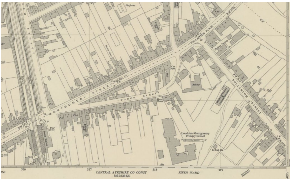
Historic Street Plan (1956 Ordnance Survey) showing Loudon Street