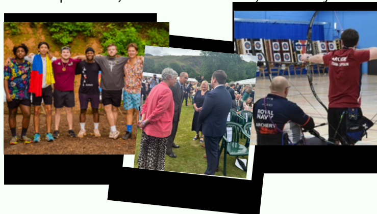
3T LP - Pg 29