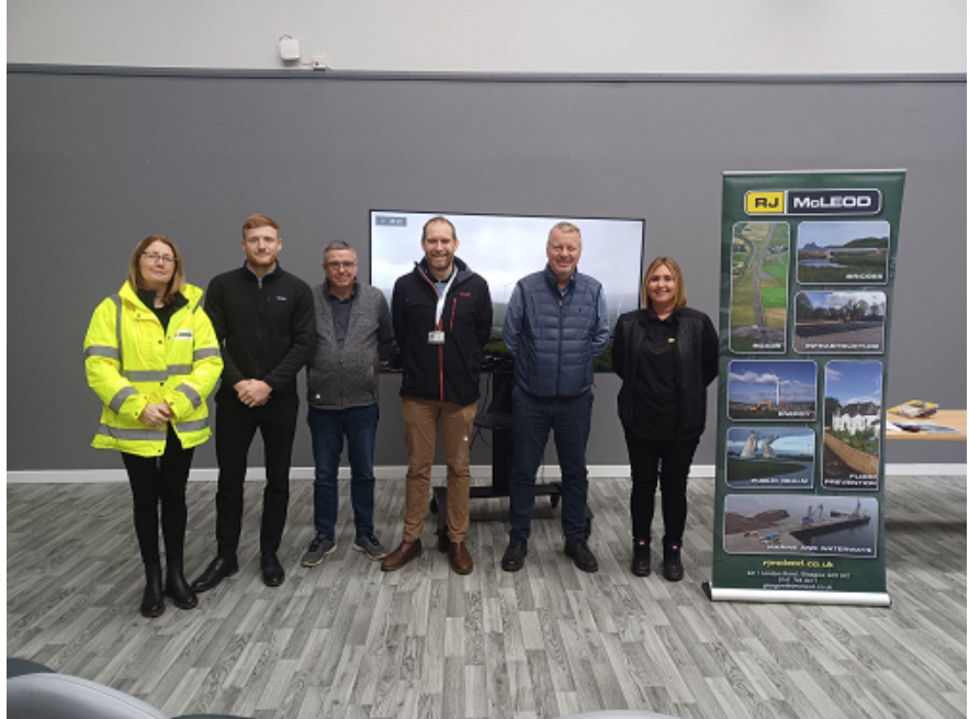
The Enabling Works team

Would you like to be featured in a future newsletter? Get in touch with us at communitybenefits@north-ayrshire.gov.uk