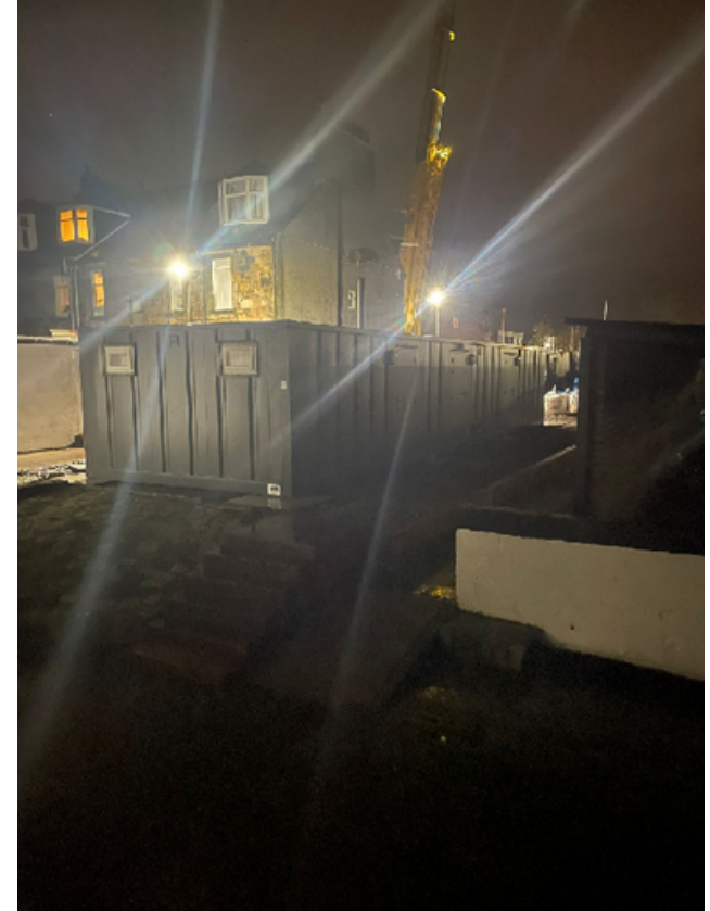
The new changing facility being craned onto site

Ardrossan Winton Rovers Youth Academy are a Community Interest Company who provide a range of volunteering, training and employment opportunities that aim to improve young lives through sport. RJ McLeod were approached by the organisation to see whether they could help them as part of their changing room redevelopment, and that initial conversation has turned into an incredible package of support to the project. Ardrossan Winton Rovers said: "Their generous work in kind has been vital to our project, especially as costs soared in the current economic climate and funding proved difficult to secure...Without their investment of materials and manpower, we would have struggled to complete the project. Their dedication, attention to detail, professionalism, and kindness have been instrumental in helping us achieve our goals. The successful completion of this project will benefit one of the poorest communities in Scotland and is a testament