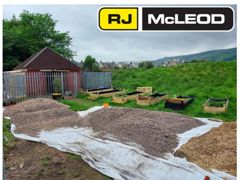
Donation of the Type 1 to Barrfields Community Garden

Finally, Largs Men's Shed have been looking for donations of timber that could be reused by their members at the Shed. RJ McLeod donated 2 flatbed pick-up loads of timber to the group, which had