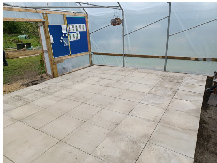
Left: the team of volunteers from Ricoh and Equal. Right: the newly fitted slabs at the end of a day of hard work!