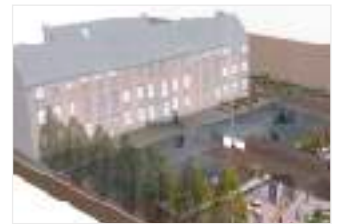
scotland street school museum