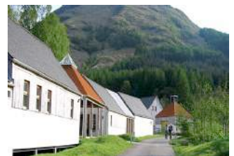
GLENCOE VISITORS' CENTRE, ARGYLL