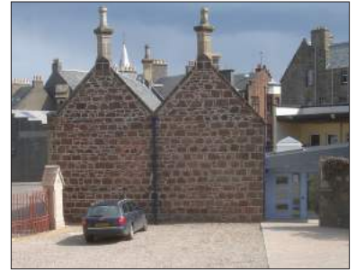
A new entrance for wheelchair access and a reception/lounge

Designs were developed integrating renewables such as air-flow heat pumps, solar water heating and photo-voltaic panels. The exterior has been carefully restored by local craftsmen, using stone indents and lime render repairs, re-pointing stonework and re-slating of the roofs.