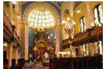
scottish jewish heritage centre