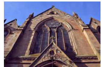
TRINITY CHURCH, GLASGOW

The Roost, Rothiemay for the Bat Conservation Trust, 2011 House extension in Rothiemay, Aberdeenshire with consideration for resident family and 2,000 pipistrelle bats which are currently roosting in the existing house roof.