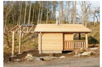
COMPOST TOILET, SALEN