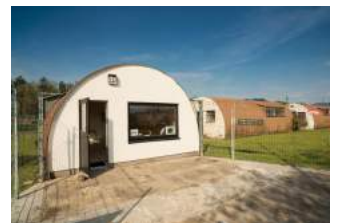
CULTYBRAGGAN VISITORS' CENTRE