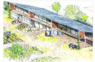
EDICT ALLOTMENTS, KIRKINTILLOCH