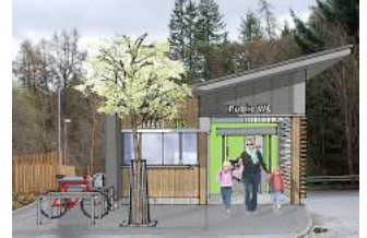
PUBLIC TOILETS, KILLIN

Keri Keri Toilets, New Zealand for Far North District Council, 1996 Development of a prototype public toilet block for 26 towns in New Zealand designed to be robust and resistant to vandalism. Walls, structure and fittings were made from enamel-coated sheet steel. Project included planning, building warrant, fabrication drawings and liaising directly with steelwork fabricators.