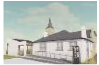
earlsferry town hall

Development of a garden shelter for staff, volunteers, community and learning groups. The sketch design will be used for funding application for a feasibility study to commence this year. The building will create a beautiful, useable space for a range of activities including tai chi, writers' workshops and wildlife education.