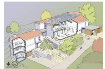
ST MARTIN'S CHURCH, CASTLEMILK