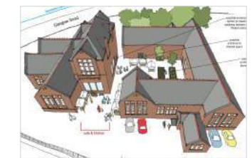
DRYFESDALE SCHOOL, LOCKERBIE

Langholm Police Station, Dumfriesshire for Eskdale Foundation, 2018 Feasibility proposals for a B-Listed, disused police station currently being transferred through a Community Asset Transfer.