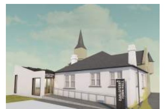
EARLSFERRY TOWN HALL