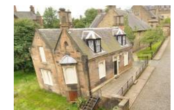
THE GATEHOUSE, GLASGOW

St James & Tureen Schools, Calton for Thenue Housing Association, 2015 Feasibility studies and building condition surveys of two existing B-listed Victorian board primary schools for conversion to mainstream housing and sheltered accommodation.