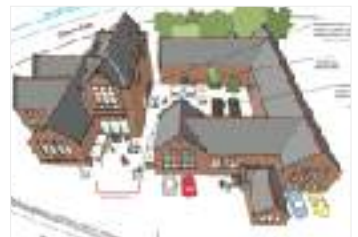
dryfesdale school, lockerbie