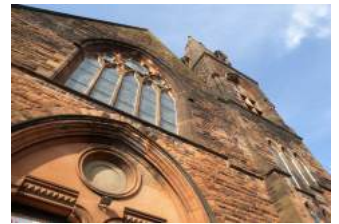
GRANGE CHURCH, KILMARNOCK