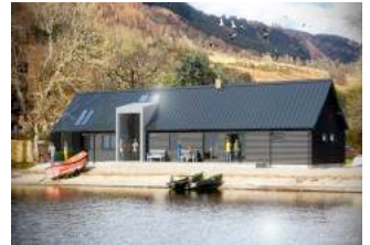
FISHERIES CLUBHOUSE, LAKE OF MENTEITH