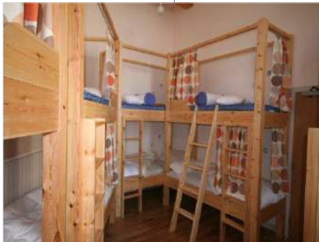
LOW ENERGY, LOW COST Low energy costs mean the building is efficient to run