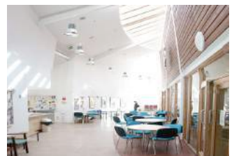
KINLOCHLEVEN COMMUNITY CENTRE