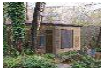
hidden hut, glasgow