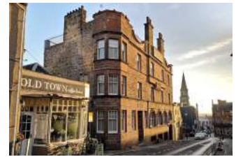
SPITTAL STREET, STIRLING

Spittal Street, Stirling for owners' association /Stirling City Heritage Trust, 2018 Working with SCTH, Stirling Council and the building owners, we managed the restoration of a 1903 C-listed tenement in Stirling Town & Royal Park conservation area. Works included stone repairs, repointing and repairs to the building's accessible flat roof.