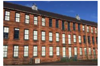
SCOTLAND ST SCHOOL, GLASGOW

Cultybraggan Visitors' Centre, Comrie for Comrie Development Trust, 2013 Refurbishment of a Category B listed WWII Nissen hut on a former POW camp into a visitors' centre with new layouts, insulation and exhibition system. A pilot scheme with A+DS to examine sustainable refurbishment of Nissen huts, we completed a feasibility study to convert further huts into self-catering accommodation.