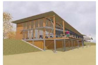
QUEEN'S VIEW VISITOR CENTRE