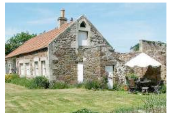
GARDEN COTTAGE, EAST LOTHIAN