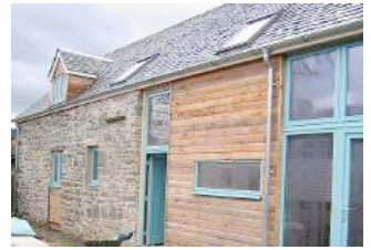
AN GOIRTEAN, KILMICHAEL GLASSARY

Feasibility study to examine refurbishment and newbuild options for the village hall at Achnacarry, Bunarkaig & Clunes (ABC). The existing hall had fallen into disrepair and no longer met the communities' needs. Our designs were for a highly energy efficient building to create a more flexible, accessible building with low running costs.